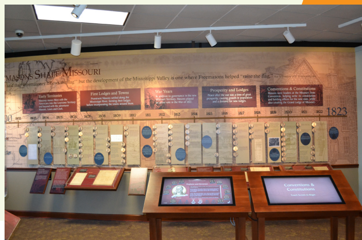
Interactive Touchscreen Displays