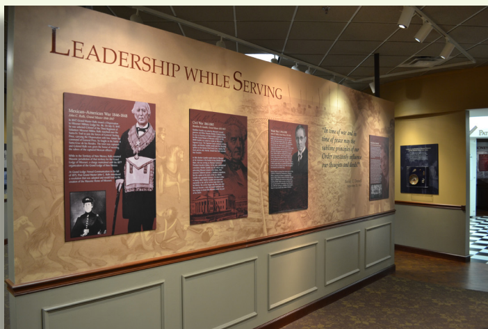
Leadership While Serving exhibit

Missouri's Masonic Museum has something for everyone. Inside, you'll find Missouri history, U.S. history, military history: the Masons have been part of it all. The Masonic Museum was beautifully constructed not only to share artifacts and documents but to tell stories, and the Masonic Museum provides another platform for Outreach to both the fraternity and the general public.